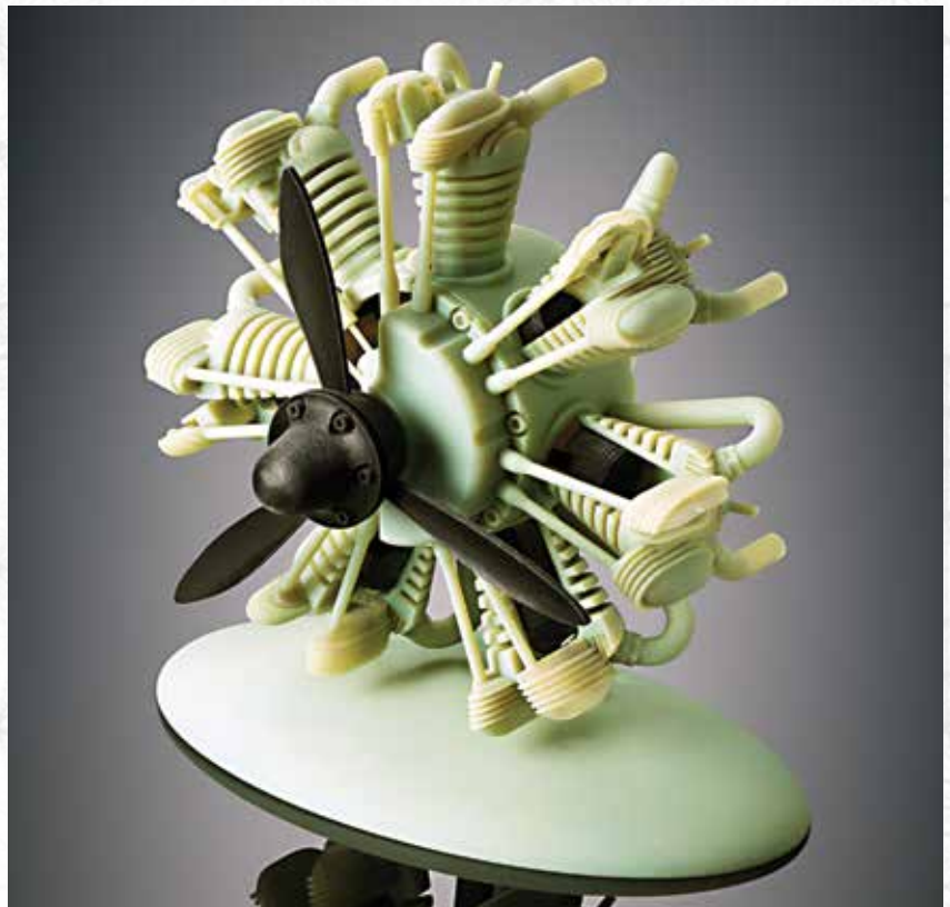
Digital abs multimaterial engine enable designers, engineers and manufacturers to create molds and models that match the characteristics of production parts

The Microsoft's Windows 8 will also support 3D printing, which is an