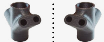
Mirror printing with 2 extruders