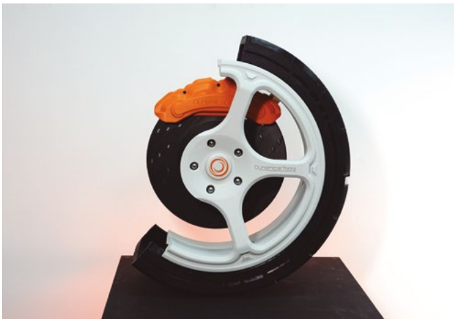
Education / Arts