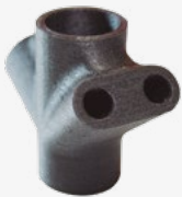
One extruder printing