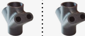
Simultaneous 2 extruder printing