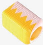
2 materials printing